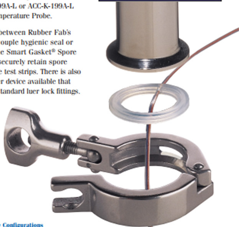
Available Configurations for the Smart Gasket®